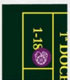
Low Bet (Manque)