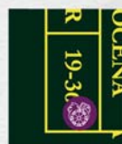
High Bet (Passe)